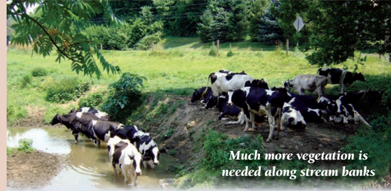
Much more vegetation is needed along stream banks

Any agricultural construction activity affecting 1 acre or more requires a Stormwater Management Plan and an NPDES permit, the same as required for all other types of construction. For example barn expansions or manure storage facilities require a permit.